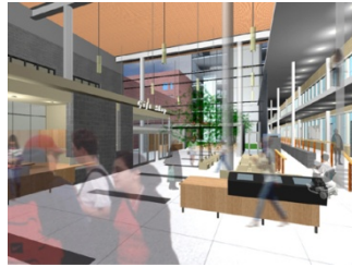
Hôpital Montfort/Hospital, Ottawa Stantec/Murphy Hilgers Joint Venture