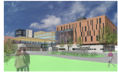
Hôpital Montfort/Hospital, Ottawa Stantec/Murphy Hilgers Joint Venture