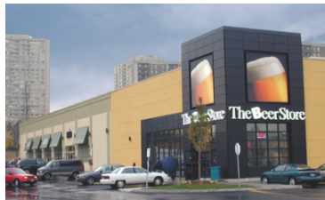
Bramalea City Centre Murphy Hilgers Architects Inc.