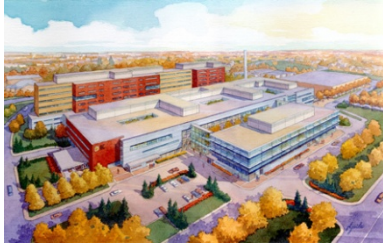
Brampton Civic Hospital Stantec/Murphy Hilgers Joint Venture