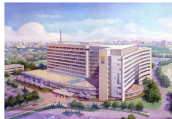
William Osler Health Centre Etobicoke Stantec/ MurphyHilgers Joint Venture

EDUCATION • B. Arch (Honours) at McGill University 1980