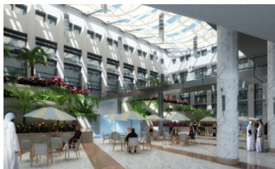
University of Sharjah Teaching Hospital Murphy Hilgers Architects