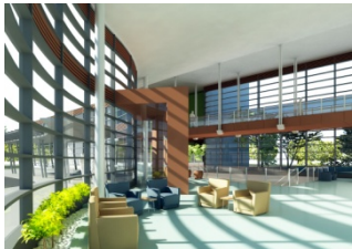
Women's College Hospital Murphy Hilgers Architects Inc.